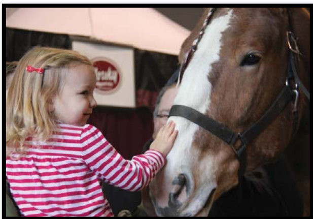
Morsky's Draft Horse Display